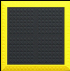
ESDA1BZ1 3ft x 3ft